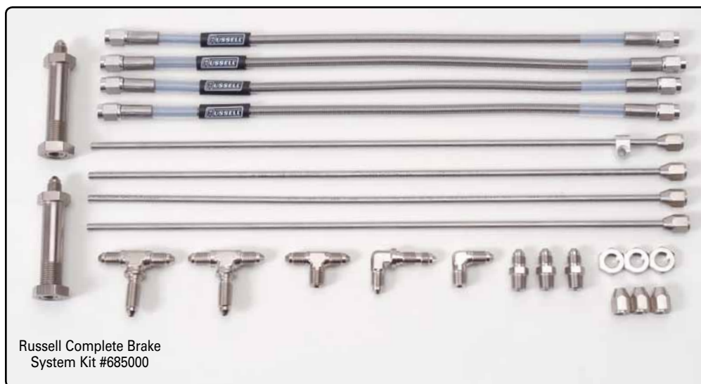
Russell Complete Brake System Kit #685000